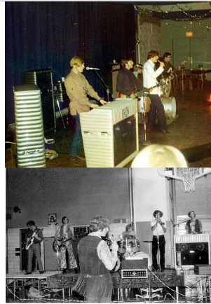
The band "Harrison" Duluth, MN circa 1970